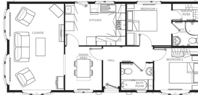
Middleton 40x20 2DB Cross Lounge