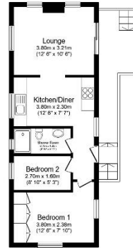
Total floor area 42.1 m 2 (454 sq.ft.) approx

This floor plan is for illustrative purposes only. It is not drawn to scale. Any measurements, floor areas (including any total floor area), openings and orientation are approximate. No details are guaranteed, they cannot be relied upon for any purpose and they do not form part of any agreement. No liability is taken for any error, omission or misstatement. A party must rely upon its own inspections. Powered by www.focusagent.com