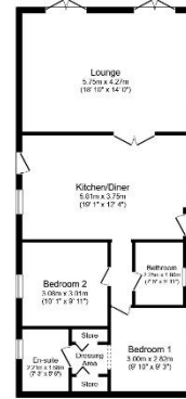
Total floor area 80.7 sq.m. (868 sq.ft.) approx

This floor plan is for illustrative purposes only. It is not drawn to scale. Any measurements, floor areas (including any total floor area), openings and orientation are approximate. No details are guaranteed, they cannot be relied upon for any purpose and they do not form part of any agreement. No liability is taken for any error, omission or misstatement. A party must rely upon its own inspector(s). Powered by www.localagent.com