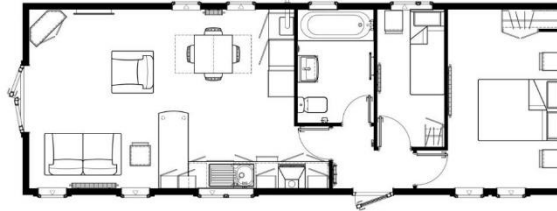
Newmarket 40'x14' 2B