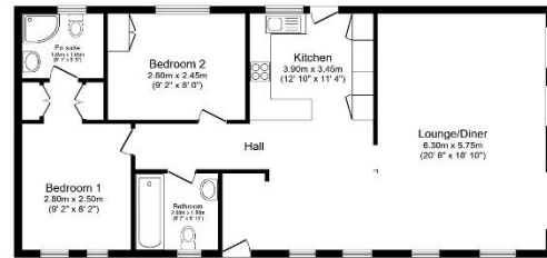
Total floor area 100.6 sq.m. (1,083 sq.ft.) approx

This floor plan is for illustrative purposes only, it is not drawn to scale. Any measurements, floor areas (including any total floor area), openings and orientation are approximate. No details are guaranteed, they cannot be relied upon for any purpose and they do not form part of any agreement. No liability is taken for any error, omission or misstatement. A party must rely upon its own inspections. Powered by www.foisagent.com