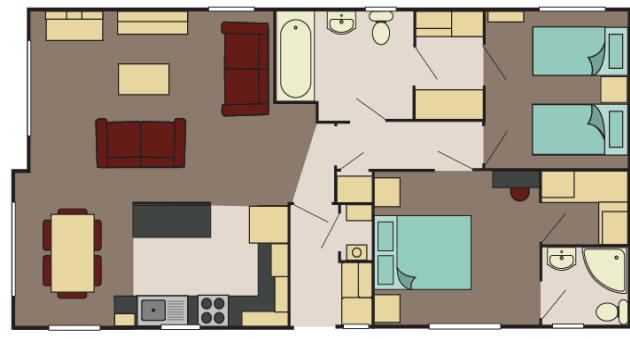
Stratford 40 x 20 2 bed