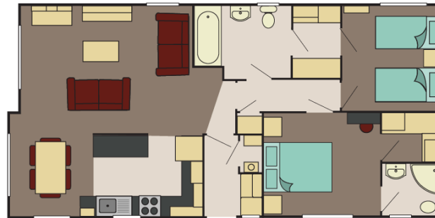
Stratford 40 x 20 2 bed