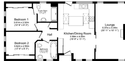
Total floor area 79.1 sq.m. (851 sq.ft.) approx This floor plan is for illustrative purposes only. It is not drawn to scale. Any measurements, floor areas including any total floor area, coverage and orientation are approximate. No details are guaranteed. They cannot be relied upon for any purpose and they do not form part of any agreement. No liability is taken for any error, omission or misstatement. Agents must refer to the sales particulars. Downloaded by www.lockport.com