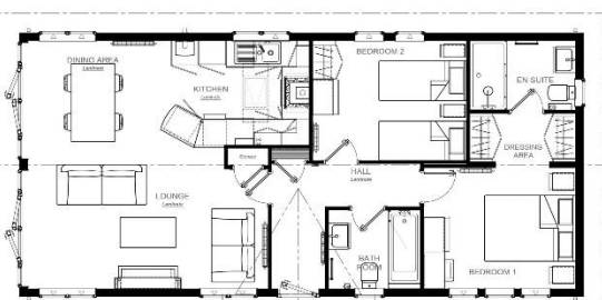
Kingfisher 40' x 20' 2DB